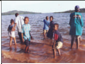
above: A new horizon is coming for these Owor children playing at Lake Victoria.