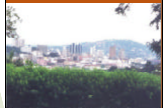
The city of Kampala, Uganda, situated in the Valley of Seven Hills.

For more information about the Charles Owor Foundation, please visit our website at: